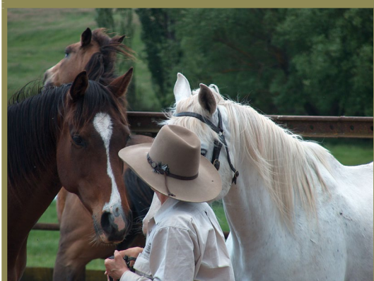
FIGURE 13 Catching a horse in a group