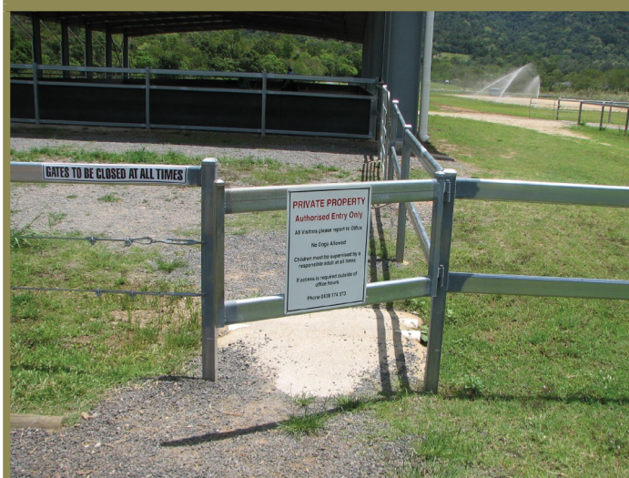
FIGURE 2 Barriers to control access to horses