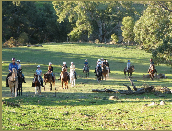
FIGURE 8 Riding in the open