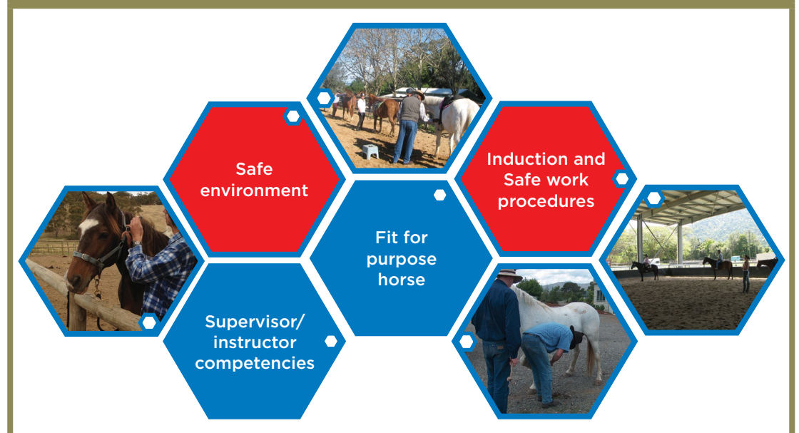
FIGURE 1 Key aspects of managing risks