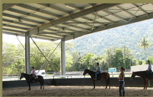
FIGURE 6 Enclosed area with fencing