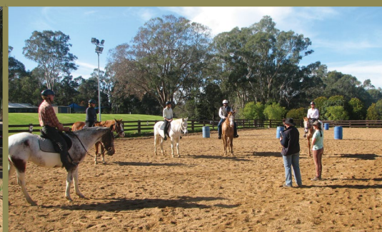
FIGURE 5 Instructor training