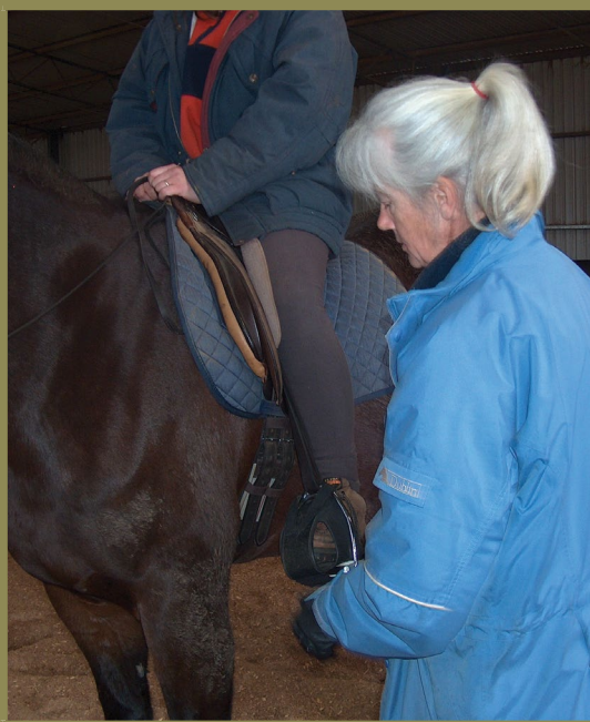
FIGURE 11 Adjust stirrups