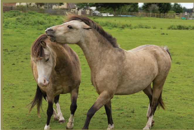
Table 4 Hazards, risks and control measures when riding a horse